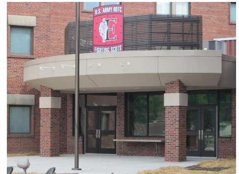
Before (below) After (left and above)